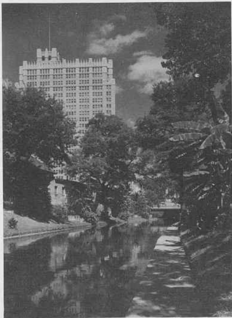
ALONG THE SAN ANTONIO RIVER