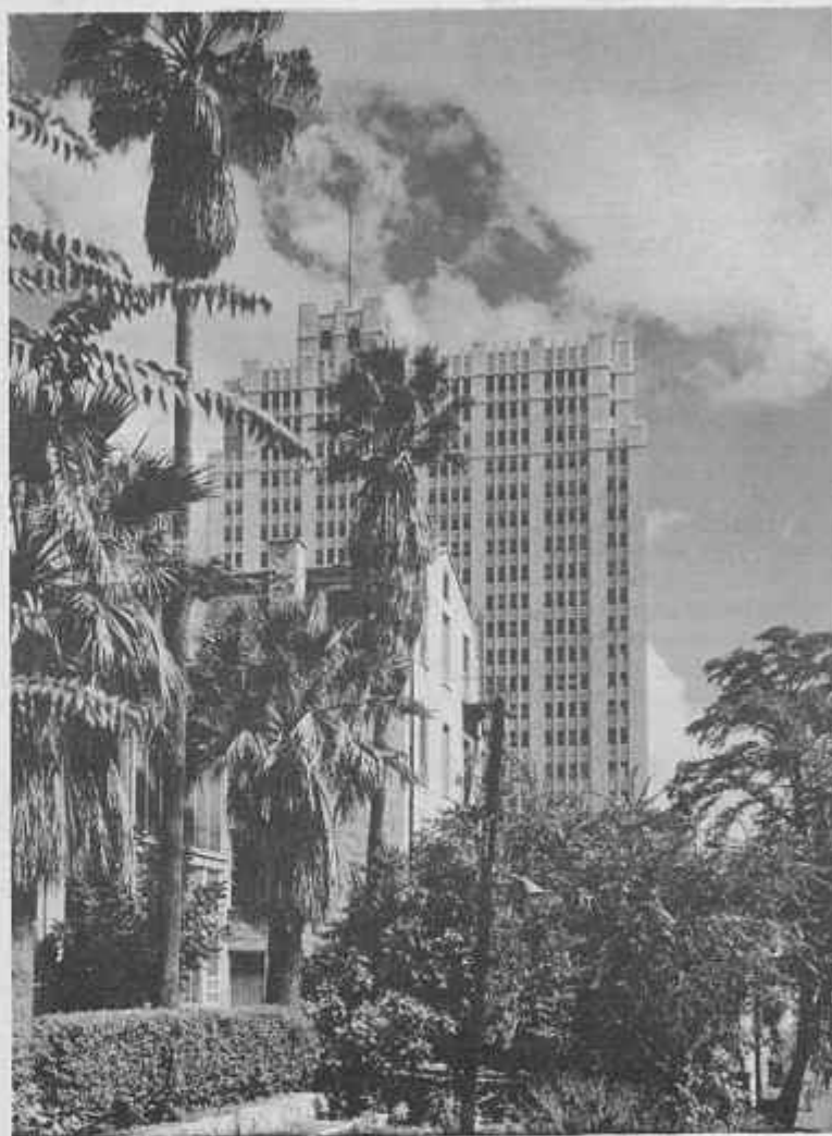
BEAUTIFUL AND HEALTHFUL SAN ANTONIO

As an indispensable basis of the work of the Hygienist , we must endeavor to secure to the patient the full benefit of all the hygienic means, in their entire plenitude, for only thus can the patient be given a fair chance of recovery. The intelligent reader should have no difficulty in understanding that Hygienic care is the only rational and radical care that has ever been administered to the sick in any age of the world at any place. The time must come when all forms of disease will be "treated" on the broad and infallible basis of Hygienic principles. When true principles are discovered, they are found to apply, not to one or two diseases only, nor to but one class of diseases, but to all diseases whatsoever. The same fundamental principles will apply throughout the whole catalogue of diseases. Even in those cases where surgery can be of value, Hygienic care should always be employed as the groundwork for the surgery.