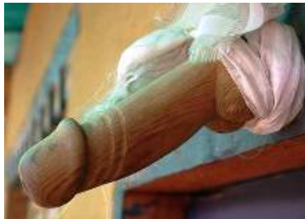
Penis art of Bhutan

there are lots of things u can do with a dick,